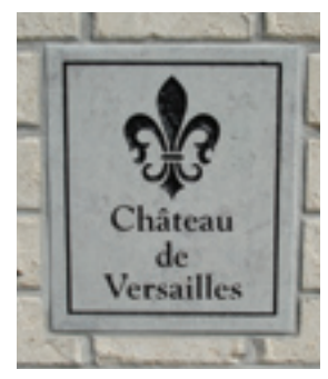
The detailed architectural plans even called for a sign (located on the column of the front entry) honoring the Château de Versailles.

Visitors to this unique home are greeted by a landscape that not only complements the French-style home but that equals its authenticity and impact. The retaining wall and paver colors complement the home and are inspired by pictures Lahren found during his research. The multiheight Highland Stone retaining wall complements the home's architecture, and the checkerboard pattern on the paver walkway was recommended by