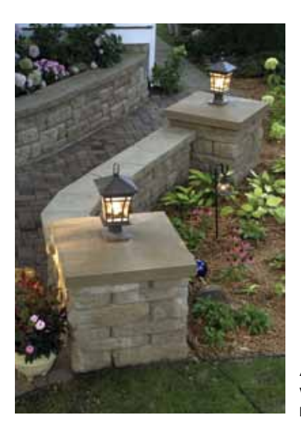
On both sides of the steps, the contractor constructed an 18-inchhigh wall, extending to the property line, eliminating the slope in the front yard. At either end of each wall, he used

"We decided on a much wider and more welcoming front walk that sweeps open at the city sidewalk. This walkway narrows and flares off to the side of the home, clearly defining the front door as the main entrance. This flare allowed us to put a small radius into the wall, giving it a much softer and more appealing look."