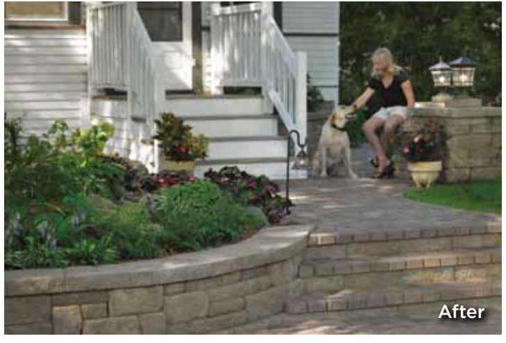
The paver walkway to the front door features a planter surrounded by a Highland Stone® retaining wall system.

A Highland Stone® freestanding wall system with lighting provides a cozy seating area.