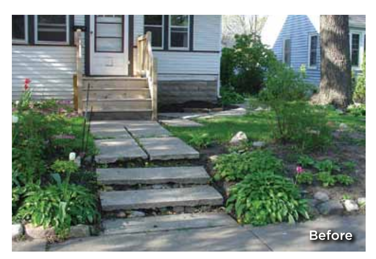
The original landscape consisted of a small walkway and overgrown plantings, and the original walkway was cracked and broken.