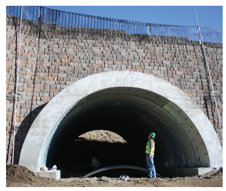
The retaining wall was built to accommodate large culverts for spring flooding and to provide a passage for wildlife.

To meet CDOT's strict aesthetic specifications, a local company manufactured two color blends: antique pewter and tan brown. The 8-inch-tall blocks in 7-, 11- and 18-inch widths and the two colors were installed randomly to blend in with the surroundings and complement the area's rock outcroppings.