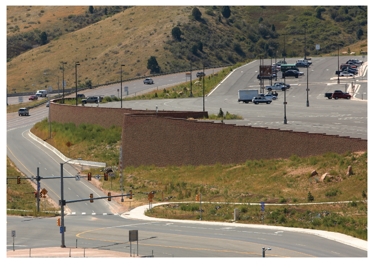
Busy exits off Interstate 70 were never closed during construction of the segmental retaining wall.

during construction so that contractors needed to be extravigilant about safety at all times. HTM Construction Company of Lakewood, Colorado, built the wall while navigating around the busy jobsite. They also needed to follow a specific installation pattern with the blocks in order to give a "wavelike" look to the wall with alternating colors. HTM Project Manager Wes Lundeby explains that the installation did not take longer than normal, due in part to the easy installation of the Diamond Pro Stone Cut product.