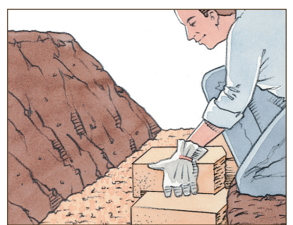
Diagram 3-Next-Course Construction