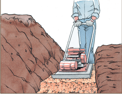
Diagram 2—Leveling Pad