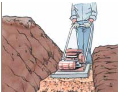
Diagram 2—Leveling Pad