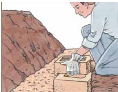
Diagram 3—Next-Course Construction