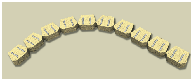
Glue each cap.