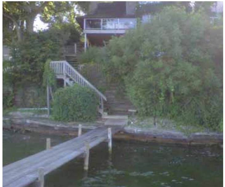
A rotting timber wall and slippery steps made access to the lake on the steep slope dangerous.

Anchor Wall Systems, Inc., 5959 Baker Road, Suite 390, Minnetonka, MN 55345. 73.3263.2 02/13 4014 1K