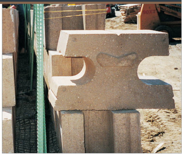
Vertica® retaining wall system blocks in the barrier wall were tied together with geogrid reinforcement.

By adding a band of slightly different colored block on portions of the retaining walls, the designer was able to meet neighborhood demands for a more aesthetically pleasing project. As for those business interruptions, using the Vertica<sup>®</sup>/ Vertica Pro<sup>®</sup> blocks meant critical time savings. It was possible to complete a wall next to a bank drive-up lane over the weekend while the business was closed. An old wall went down Friday night, and the new wall went up on Saturday. According to the design engineer, a cast-in-place structure would have kept the lane closed for weeks, a situation that was unacceptable to the bank.