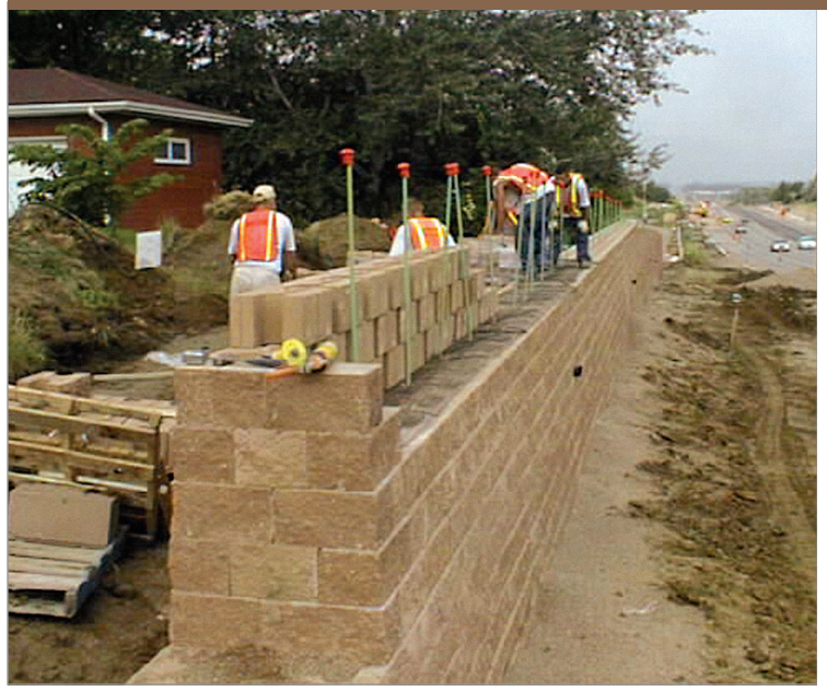
The geotechnical engineer specified gravel fill rather than concrete for this barrier wall made of back-to-back modular units so that it could be more easily repaired in the event of an accident.