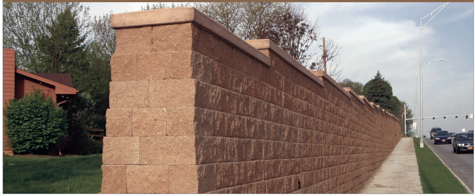
The barrier wall shields the residential neighborhood from the traffic noise of West Dodge Road in a natural earth color that fits the area.