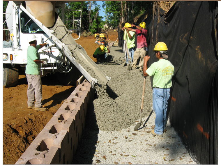
The completed wall before work on the parking lot began. The property behind the wall, which belongs to another owner, was undisturbed because little excavation was needed.