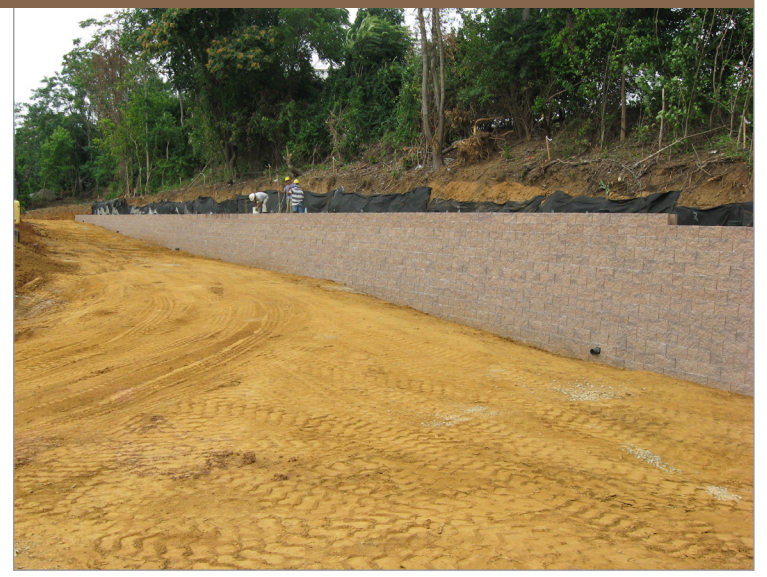
Even with a small space and close property line, the parking lot was expanded due to the use of the Anchorplex<sup>™</sup> retaining wall system.

While the property owner was thrilled with the engineering solution that let the parking lot be built, the best news came with the budget. A big-block system using 6,800-pound blocks was bid with a hefty price estimate. The Anchorplex<sup>™</sup> system built with the Vertica<sup>®</sup> product was bid and came in at about 77 percent of the big-block estimate. For the 2,100-square foot job, the savings were more than $10 per square foot.