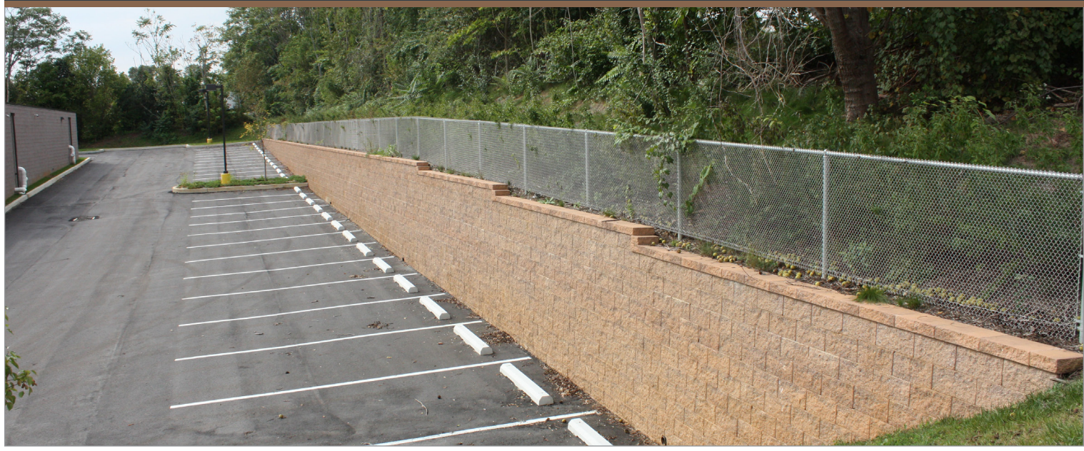
A traditional segmental retaining wall requires significant excavation, but the Anchorplex™ retaining wall system uses structural backfill and requires less excavation.