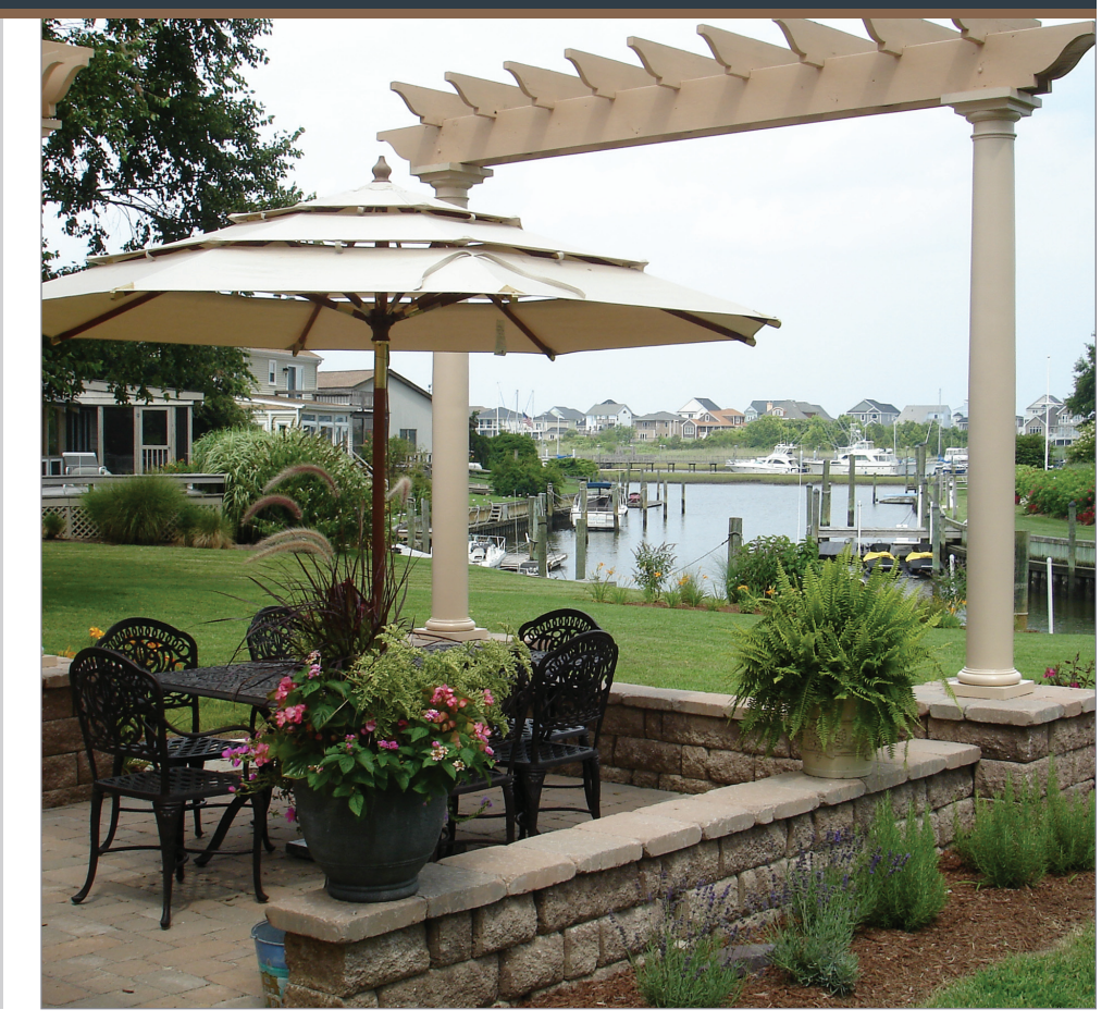
The renovated patio features a Highland Stone® freestanding wall system and a pergola surrounding a dining area.