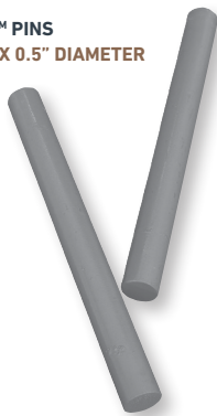
ANCHOR™ PINS 5" LONG X 0.5" DIAMETER